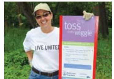
Volunteers from Boehringer Ingelheim installed a Born Learning Trail at the Pratt Center in New Milford as a Day of Caring project

United Way helps parents, grandparents and caregivers support learning through its Born Learning public awareness campaign. Fun, educational materials that encourage early childhood learning and healthy development are disseminated to families throughout the community. Born Learning Trails are being installed in parks and schools throughout western Connecticut by United Way volunteers.